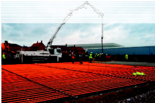
Collector array being installed, Howe Dell School

ICAX Limited provides a turnkey package for meeting sustainable energy targets on construction projects. We undertake design and installation to ensure that heating and cooling needs are met in a sustainable way.